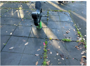
Existing Playground Flooring