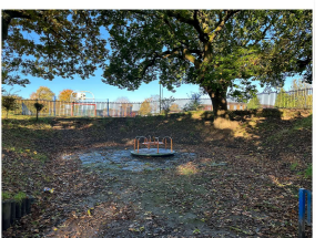
Existing Play Area