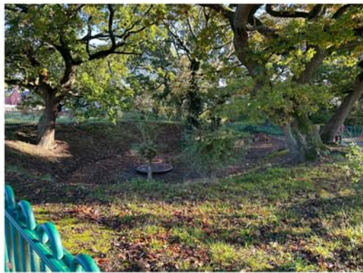
Site Photo 1 - Existing Play Park