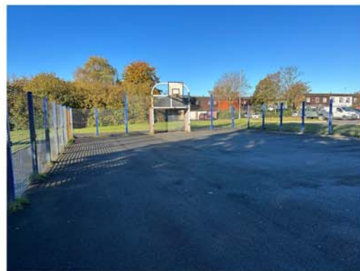
Site Photo 5 - Existing MUGA