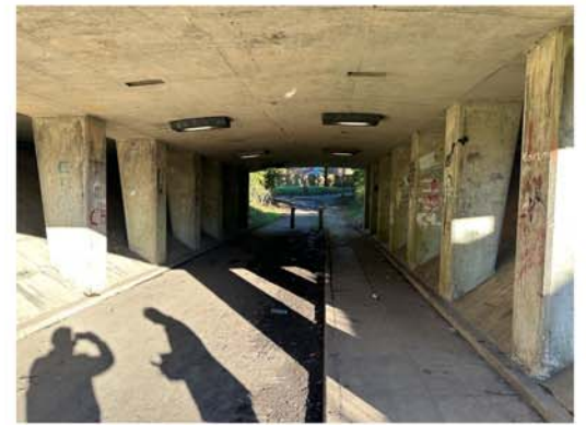
Site Photo 3 - Existing Underpass