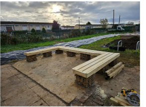
New bench seating

New graffiti artwork to underpass with improved lighting to create a safer walking environment.