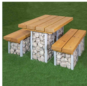
New Tables and Benches