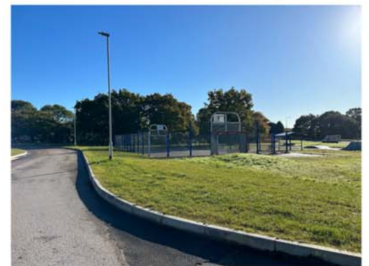
Site Photo 6 - Existing New Access Road