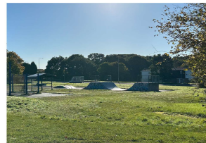
Existing Skate Park

Fence, surface and existing equipment to be cleaned and painted.