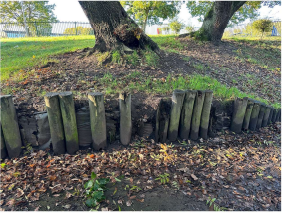
Existing Retaining Wall