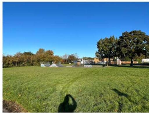
Site Photo 2 - Existing Skate Park