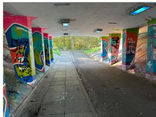
Site Photo 4 - Existing Underpass